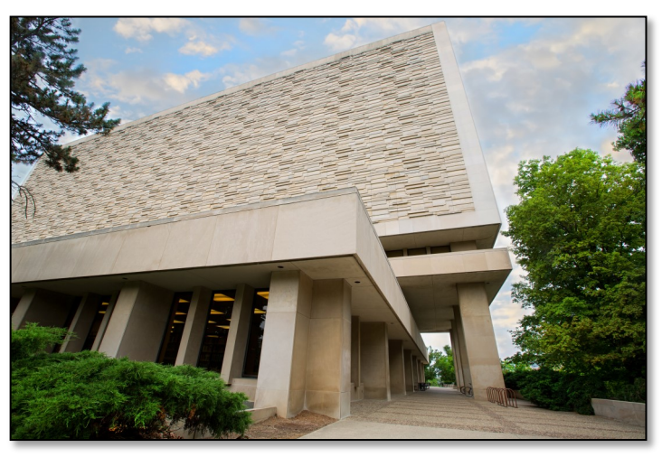
The Herman B Wells Library at IU's Bloomington campus

IUB first began working with Samvera (then Hydra) in 2011 with the launch of Avalon Media System, co-developed with Northwestern University Libraries, with support from IMLS and the Mellon Foundation. The success of this experience led to