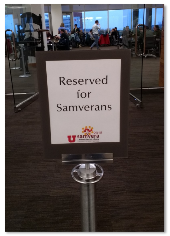
Exclusive dining facilities at Connect 2018!

This year also saw the emergence of the Hyrax Working Group - a team of Community contributed developers whose focus is on providing stability to the Hyrax codebase, and facilitating progress on the Hyrax Roadmap. The Hyrax Working Group was largely responsible for the accelerated rate of releases for Hyrax as well as helping us realize our promises for semantic versioning, version support, and managing technical debt.