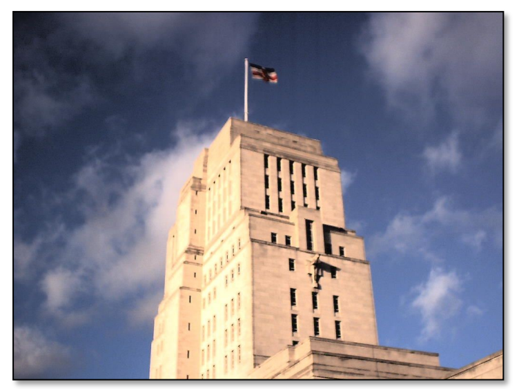
Senate House Tower at the University of London

The King's Fund Digital Archive was migrated from EPrints using an importer script we adapted from Hyku. It contains over 1700 digitized publications from the King's Fund, some 130,000 images. Central to the King's Fund Digital Archive was the use of Universal Viewer and the International Image Interoperability Framework (IIIF) – a feature that was available in Hyku, and has since been made available in Hyrax. We were able to enhance the IIIF support in Hyku and added a custom IIIF Search which we're hoping to contribute back to the community in future.