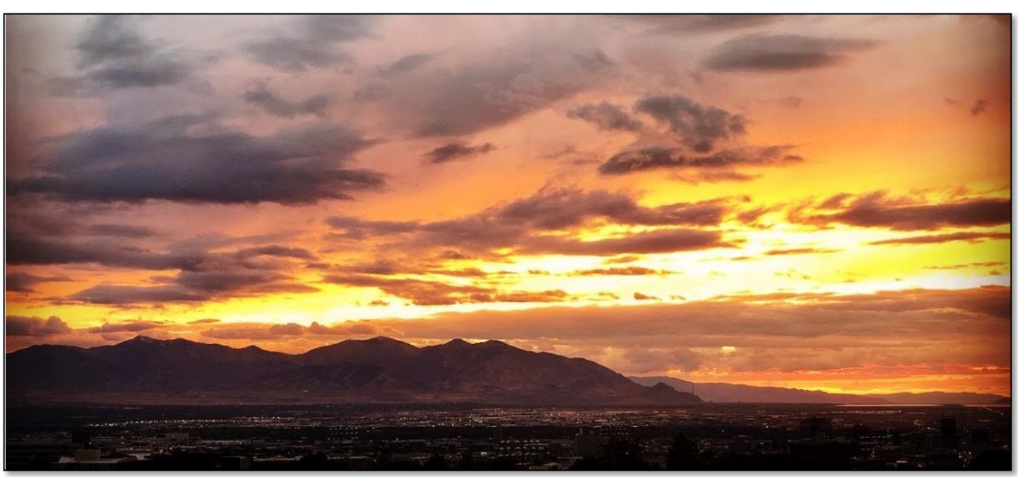
Sunset at Samvera Connect 2018 in Salt Lake City