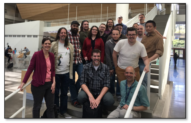
Samvera Camp at OHSU in Portland, OR

Samvera Partner DCE hosted an introductory training camp at the Oregon Health and Science University aimed at building the skills of those new to working with the Samvera technology stack.