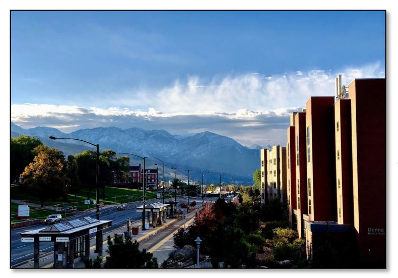
Dawn over the mountains by Salt Lake City: a day of Samvera Connect beckons!

Outside of meetings, the Samvera Interest and Working Groups continue to provide focused opportunities to come together and discuss specific themes of interest. Noting those that have already been mentioned, the longstanding work of some of the groups is now well-established and they continue to produce valuable outputs - for instance, the final report of the MODS and RDF Descriptive Metadata group brought the year to a productive close. 2018 also saw