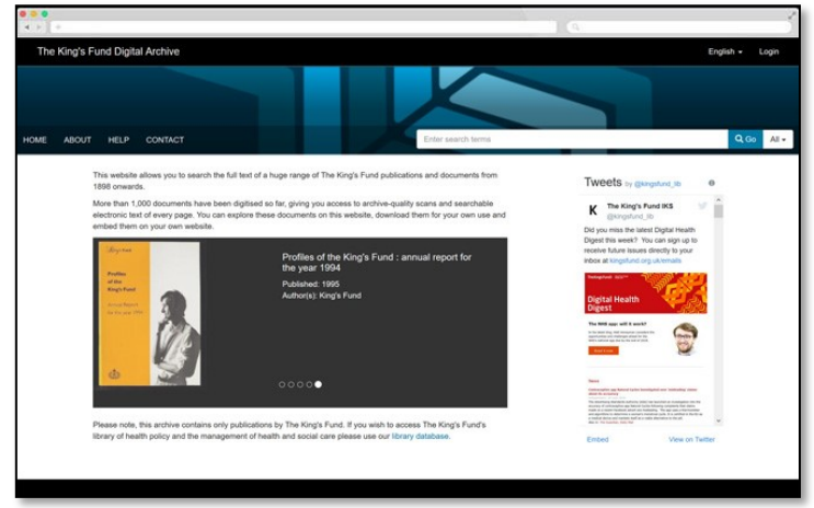
The King's Fund Digital Archive

Hyku, in particular, was of great interest to us as a lot of work has gone into making it 'ready for hosting', which means that we could offer easily deployed services. This also helped us in lowering the barrier for adoption of our new solution. Our first Hyku customer, The King's Fund, were already using our repository services. They were interested in moving their repository to Hyku because it offered them a more flexible solution. Not only could support their current content, but it could also provide a robust base from which to develop their repository in line with their own expanding digital content and services into the future.