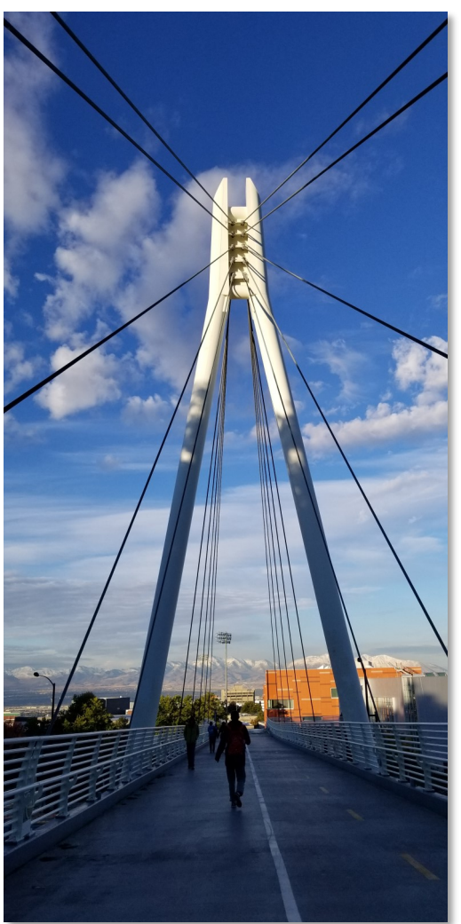
The Eccles Legacy Bridge at the University of Utah—part of the walk to and from Connect 2018 for many delegates

To better connect with existing users and those interested in learning more about Avalon, the team implemented the Avalon Forum, a monthly update on Avalon development progress and a providing a spotlight on work occurring at user institutions. We also instituted weekly Office Hours, giving the wider community a chance to meet the Avalon team and discuss issues, questions or any Avalon-related subject. For those considering Avalon, all-