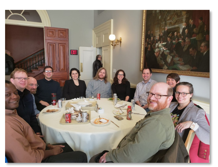
Princeton's distributed repository team visits campus

The solution we ultimately implemented is Valkyrie — a new persistence layer for Samvera applications that allows using multiple backends, including Fedora and PostgreSQL. Our new repository, Figgy, uses Valkyrie with PostgreSQL, allowing us to meet our performance goals and continuing to use a number of Samvera community gems, including hydra-head, hydra-access-controls, hydra-editor, hydra-role-management, hydra-derivatives, iiif_manifest, and most recently, BPL's blacklight_iiif_search. Figgy is a staff tool for ingesting files, building digital objects, and managing workflow. Once published, objects are shared with other applications using IIIF, and are embedded in our Blacklight catalog, Spotlight digital collections site, and GeoBlacklight maps portal.