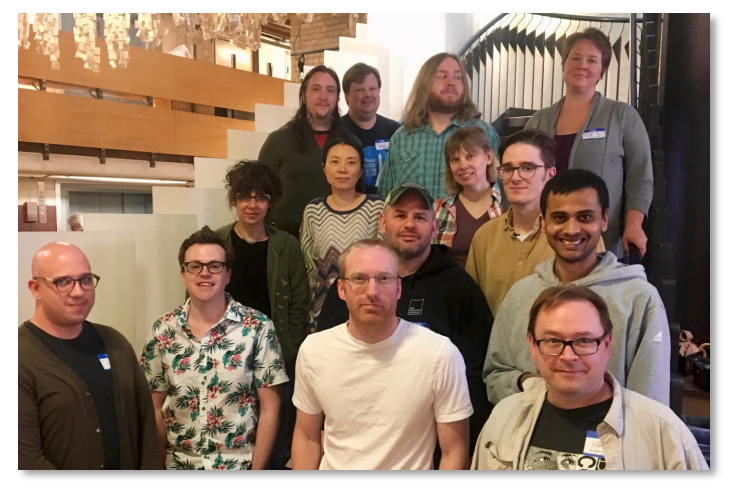
Participants at the Advanced Samvera Camp in Minneapolis May